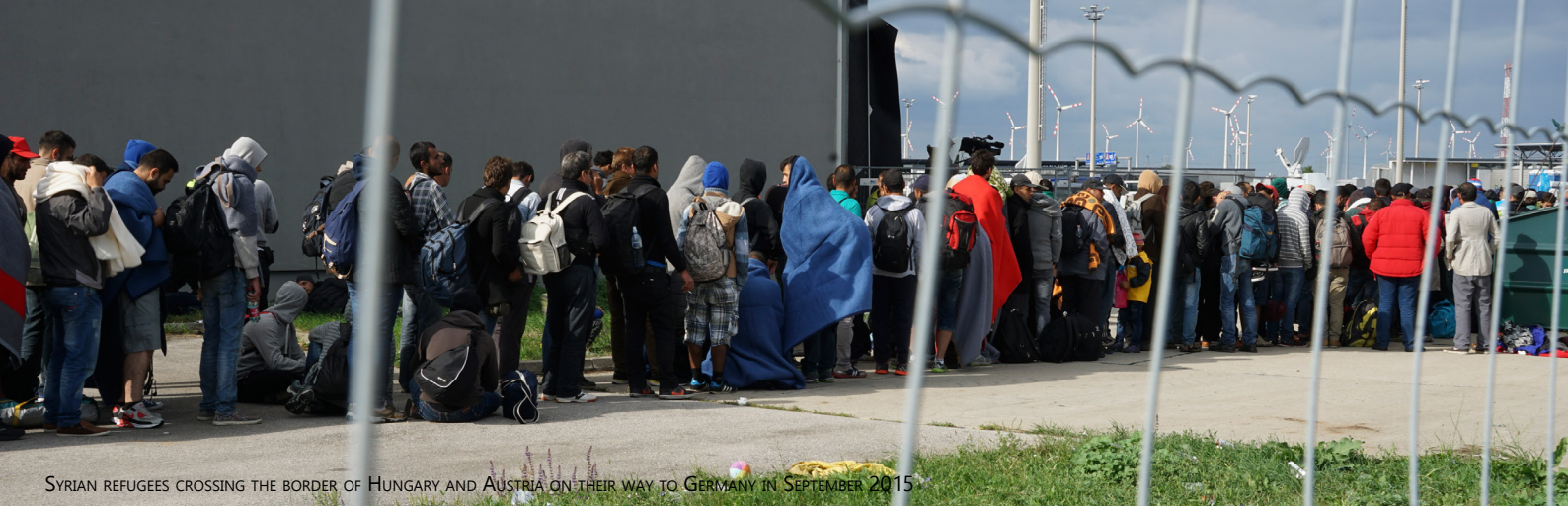
SYRIAN REFUGEES CROSSING THE BORDER OF HUNGARY AND AUSTRIA ON THEIR WAY TO GERMANY IN SEPTEMBER 2015